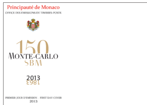
Special FDC for the block "SBM"