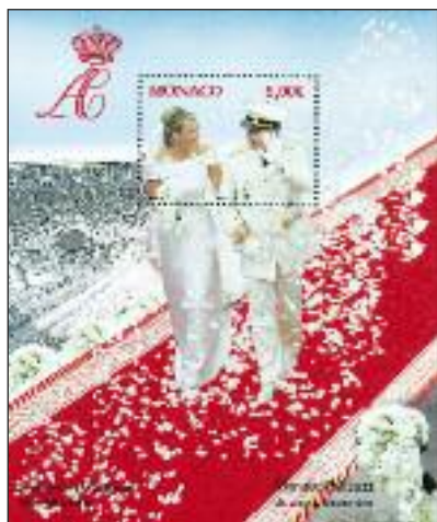
of Monaco. > Issue on December 2, 2011 / FDC big size

From 2 nd to 4 th December 2011, the international exhibition MonacoPhil presented 100 world rarities, including items from the collections of Her Majesty Queen Elizabeth II and H.S.H. Prince Albert II, as well as some exceptional exhibits, some of which were on display for the first time in Europe. The 80 stands representing postal administrations and international dealers offered the public an opportunity to discover stamps from all over the world. The block issued especially for the occasion evokes, with a certain romanticism, the wedding of the Sovereign Prince and Charlene Wittstock, who has since become Princesse Charlene