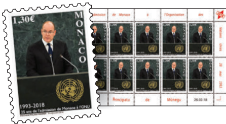
Printing process : Offset Size of the stamp : 30 x 40,85 mm Quantity of issue : 45 000