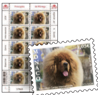
Printing process : Offset Size of the stamp : 40,85 x 30 mm Quantity of issue : 45 000

> Issue on 18 February 2019 / FDC small size